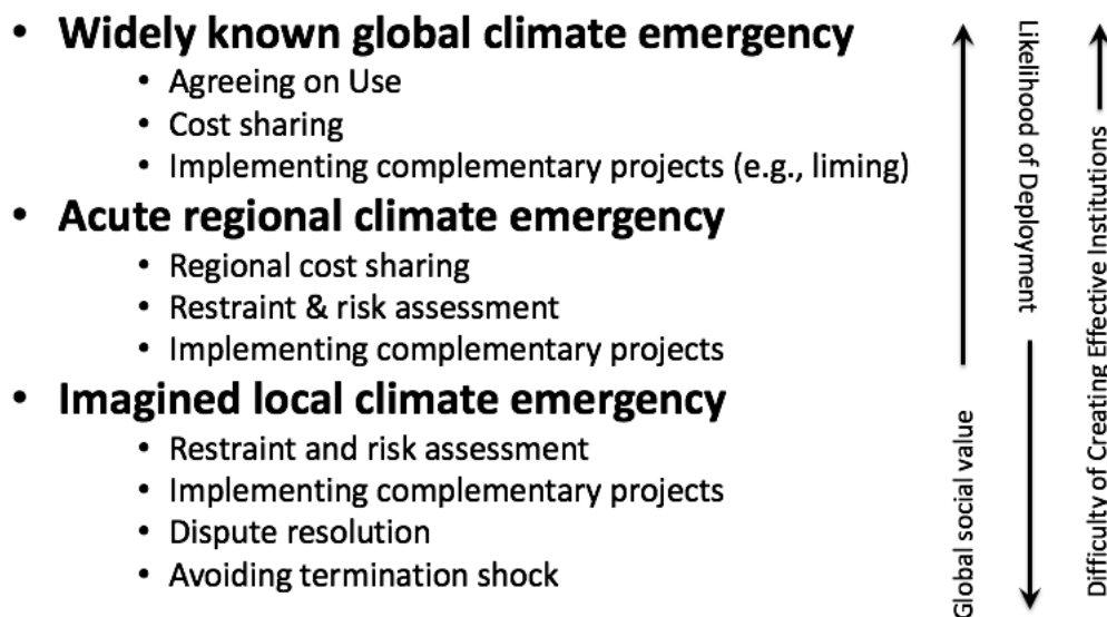
Figure 1: Stylized Deployment Scenarios for Solar Geoengineering

For too long, the discussion of geoengineering governance has involved too much imagination about governing institutions and not enough attention to the incentives for countries to build such institutions. A focus on incentives may suggest that it will be impossible to gain truly global support for institutions that can effectively restrain unilateral geoengineering. But it also suggests that there could be very powerful incentives for countries to create something different: a club that prepares responses to unilateral geoengineering. An ideal world institution for global governance of geoengineering may be tempting to envision, but this outcome is unlikely. A “blade runner” world of countries working together to counter rogue geoengineers presents a darker picture, but is perhaps more probable and therefore a more useful basis for practical discussions of governance.